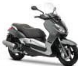
Aluminum Slate (MNM2)