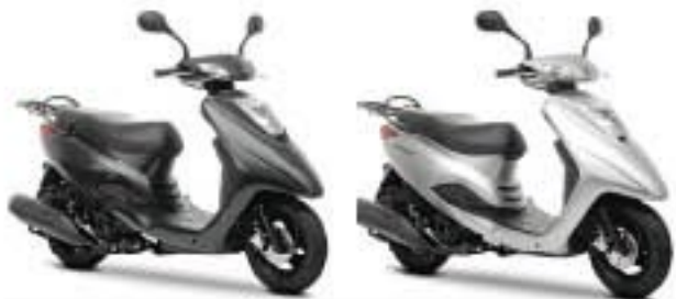
Gun Metallic (MDS)

► 10inch wheels mean quick steering, super-light rider inputs and easy low speed manoeuvrability. Front disc brake and tuned suspension provide assured handling and braking. Instrumentation is a model of clarity.