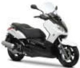
Competition White (BWC1)

► X-MAX 125's all-weather, all-year-round mobility solution raises the pulse on every journey. Front and back disc brakes and sports-tuned suspension give inspirational handling.