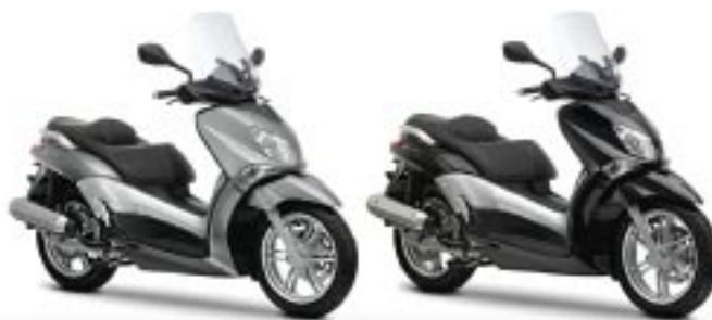
Solid Metal (BNM6)

► X-City 125 is packed with practical, thoughtful features. Roomy underseat storage, secure glove compartment and informative backlit instrument panel come together in a civilised transport solution that's easy to live with.