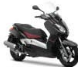
BLACK X-MAX (MSM1)

► Meet a very special new X-MAX: the BLACK X-MAX 125. A unique matt black body with red accents. Carbonfibre-look trim and dynamic graphics on the fairing and wheels.