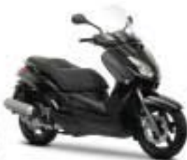
Midnight Black (SMX)