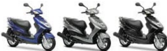
Bell Flower (DPBMA)

► Rear drum brake on the compact CygnusX gives predictable, controlled stopping. Powerful headlight lifts road presence, safety and night-riding confidence whilst the dual seat gives both the rider and passenger a great ride.