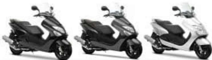
Classy Stone (SMH)

► 12inch wheels are both disc-braked for reassuring braking. High quality bodywork features twin 'fox-eye' headlights. Stylish instrument pod with trip computer shows all information at a glance.